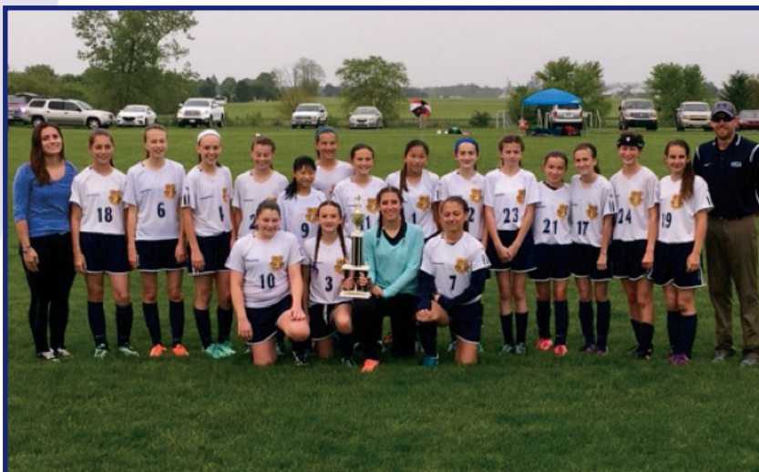
The Middle School Girls Soccer Team were the winners of the MDCC tournament! They won the championship game against Heritage Academy 3-0.