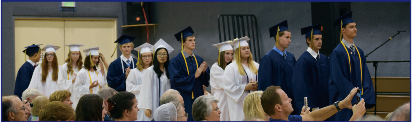
The moment has arrived--waiting to receive their diplomas!