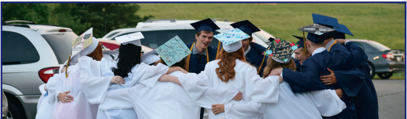
Graduates gather together one last time!