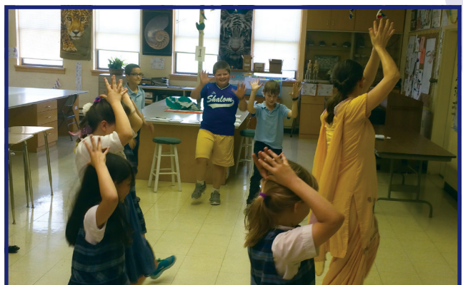
Students learned about dance in other cultures.