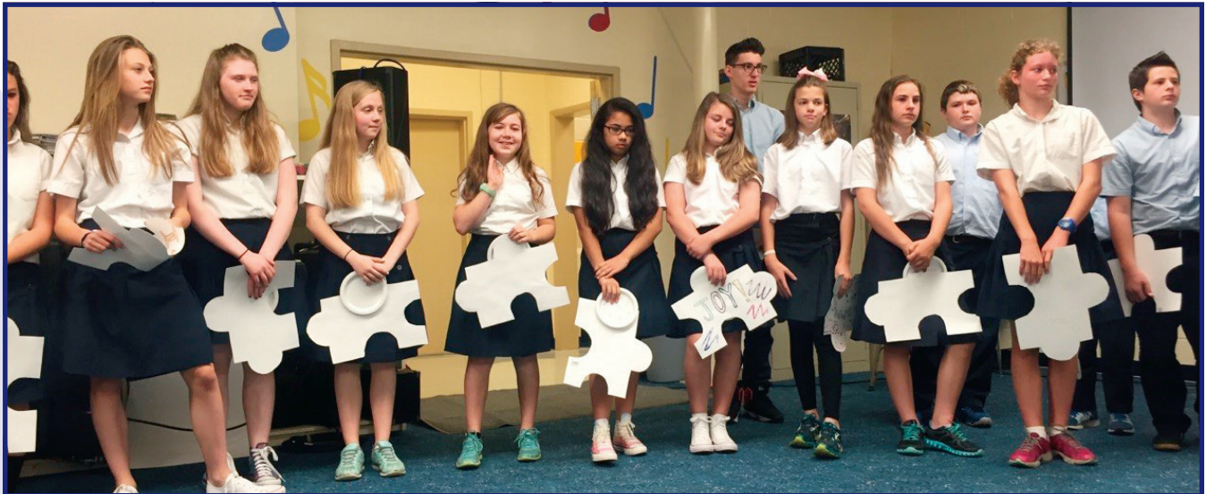
Each student is holding a piece of irregularly cut pasteboard with individually chosen words that form a design, when fitted together, of words essential to building an inclusive learning community.