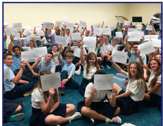
Students are holding up the community pledge they voluntarily signed to show their willingness to create and sustain an inviting learning community to which each person can thrive and succeed.